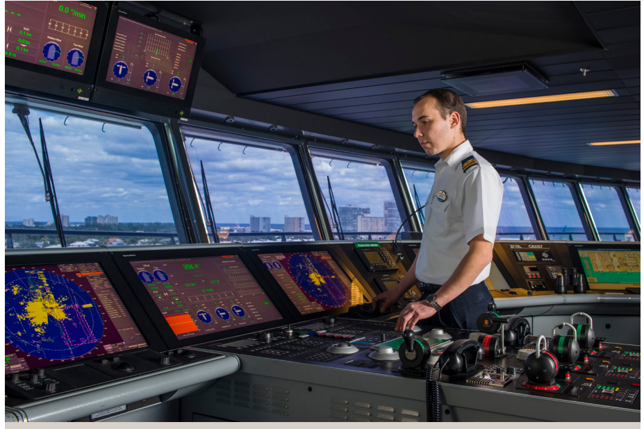
Integrated Bridge System on board the Allure of the Seas

Common responsibilities such as safe navigation, route planning, navigational status monitoring, log-keeping, alarm awareness and day-to-day chart management are made easy through common workstation layouts via harmonised menu structures.