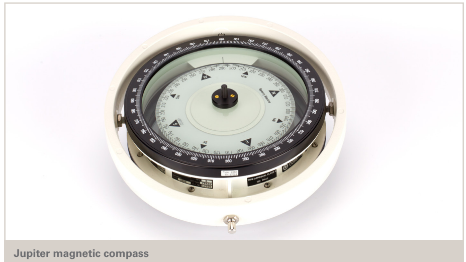
Jupiter magnetic compass

Reflector tubes are available in the following lengths: 1000, 1500 and 2000mm.